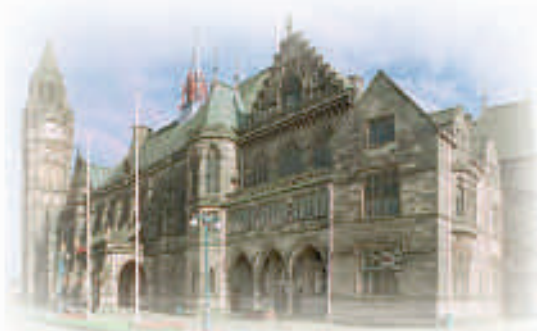
Rochdale Town Hall