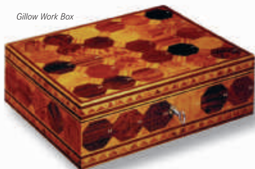
Gillow Work Box